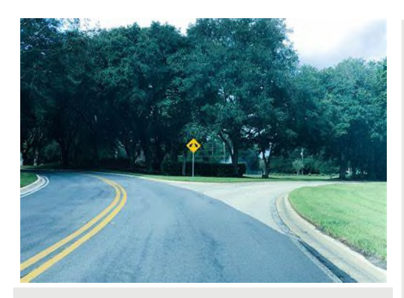
Striving to Start your Kids Off on a Sound Financial Path in Life (continued)

Then you can choose a savings plan. You can determine what account makes the most sense and the strategy of how it should be funded (up front, monthly, etc.). Below are several options that may be worth considering -